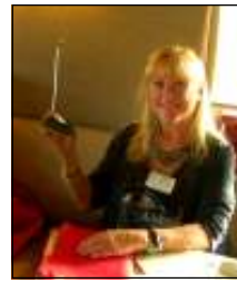
Giving the Solar Lights to the Bri Bri children of Costa Rica